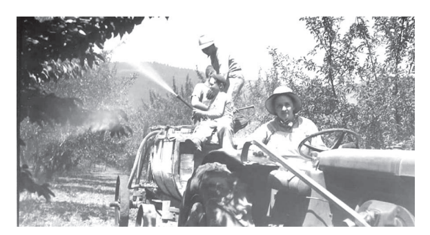
Spraying cherry trees with Rotenone at Young orchard, Mt. Glen, Grande Ronde Valley, 1940s

About four or five years later, they decided to ban the Rainier as a cherry. Now they'd do anything to get Rainier cherries. They like them, but they are a softer cherry to can.