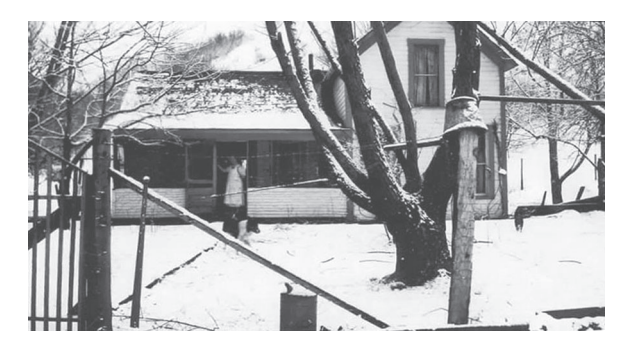
Banton home in Ladd Canyon, 1930