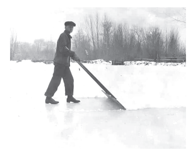
Clearing snow in preparation for cutting ice