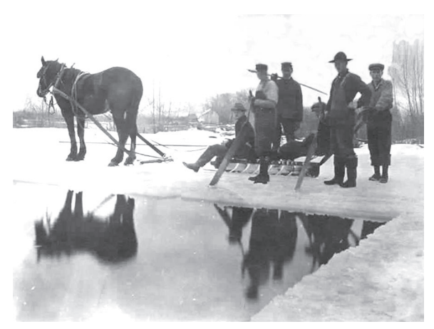
Men with saws for cutting ice and horse and sled to transport it