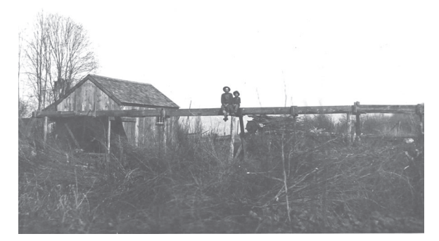
Flume at Bantons' Ladd Canyon ranch, used to provide rotary power to shop tools, such as wood lathe, drill, and sander, 1914