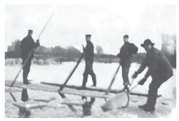
Using poles and tongs to harvest ice