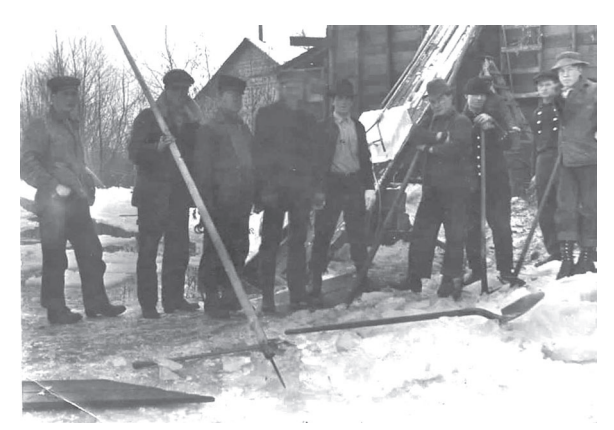
Putting up ice in sawdust-lined ice house