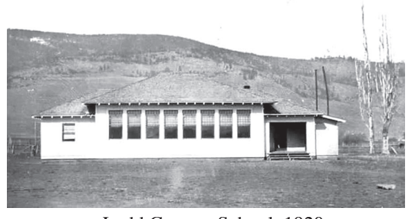
Ladd Canyon School, 1920s

time, saw what we were doing, and helped us with our work, if we needed help.